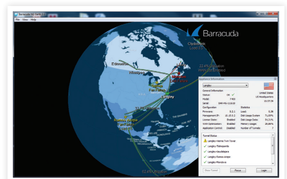
Barracuda Earth - the graphical real-time 3D network monitoring utility of the Barracuda Firewall Control Center, provides a status overview of all VPN site-to-site tunnels.

As a company with internationally distributed facilities, the centralized management concept particularly impressed us – Barracuda therefore quickly became our partner of choice.